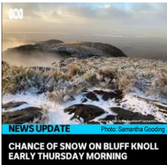
NEWS UPDATE CHANCE OF SNOW ON BLUFF KNOLL EARLY THURSDAY MORNING

Tuesday, 26 September 2023 6.30 pm, Porongurup Tearooms RSVP: 12 September to Helen or PCA Facebook page